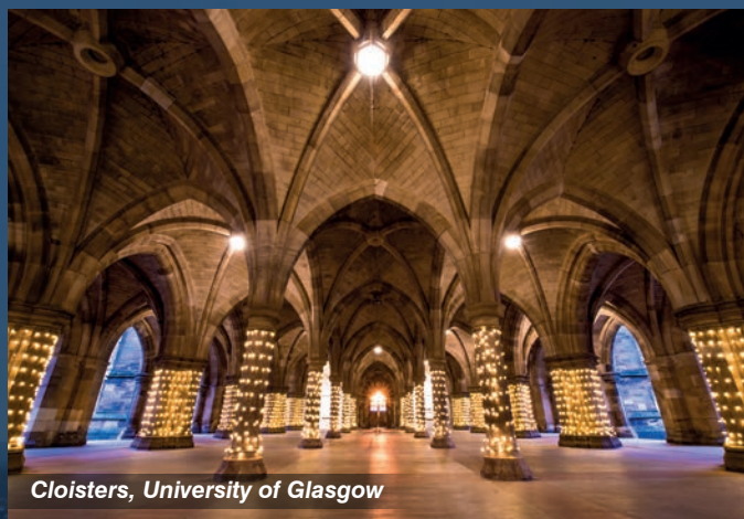
Cloisters, University of Glasgow