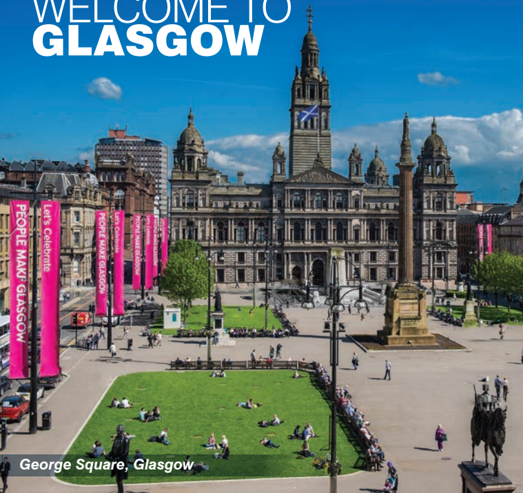
George Square, Glasgow

It is our pleasure to welcome you to the 75th Annual Congress of the International Institute of Public Finance, held at the University of Glasgow.