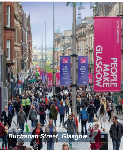
Buchanan Street, Glasgow

Glasgow was voted “The world’s friendliest city in the most beautiful country”*, and as Scotland’s largest city, is a metropolitan hub, offering a vibrant mix of cultural and social activities that will enhance your experience of the congress.