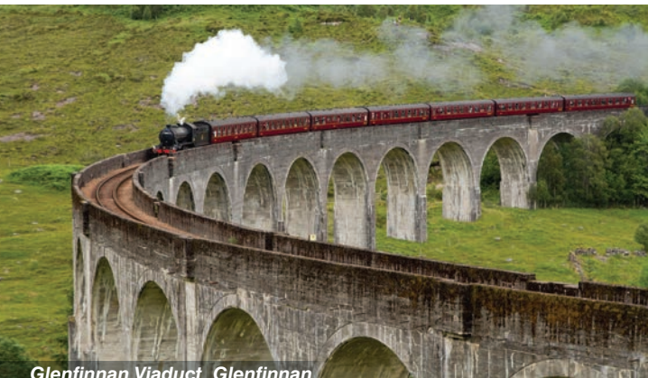
Glenfinnan Viaduct, Glenfinnan

As the IIPF congress is the leading annual public economics event worldwide, we also warmly welcome submissions in all areas of public economics.