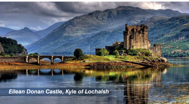
Eilean Donan Castle, Kyle of Lochalsh

Plenary and Contributed Sessions, Dinner